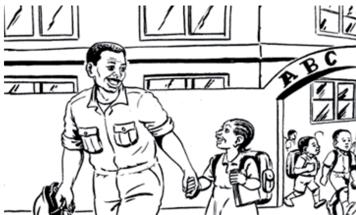
This father's work schedule makes it possible for him to pick up his child from school after work.

Be also aware of any national or local laws on the maximum number of weekly working hours and rest. They will help you to decide what working hours are reasonable.