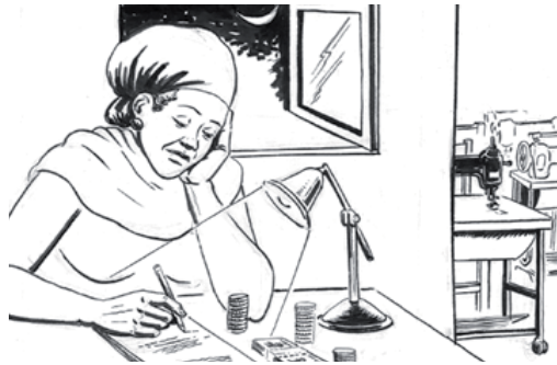
This entrepreneur is tired and still working late at night.

The results of this can be sickness, absences, lateness and, consequently, lower productivity. But good management of working time can greatly reduce such problems.