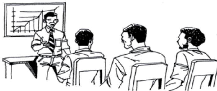
This manager is consulting with workers on how best to arrange work tasks whilst one worker is on maternity leave.

To promote cooperation: It is important that women on maternity leave are allowed to rest and have their time with their baby. However, some women are reassured about their future by being kept up to date. Encourage colleagues (rather than managers) to keep in touch with her informally and, near to her return date, you could send her a message to let her know that, if she wishes, you would be happy to talk to her about her future work schedule needs.