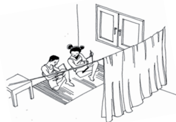
This simply constructed waiting area gives children somewhere safe to wait until their parents finish work.