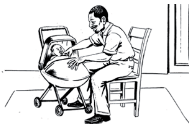
This father is pleased to have some time off to spend with his new baby.

Paternity leave is becoming more and more common in national law and in enterprise practice, particularly in collective bargaining agreements, reflecting the increasing importance attached to the presence of the father around the time of childbirth. Among the countries for which there is information on national provisions for paternity leave, the duration ranges from one day to three months and it is usually paid.