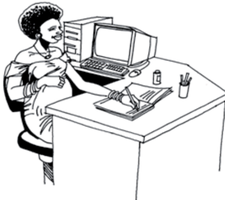
This worker is healthy and able to carry on working late into her pregnancy.