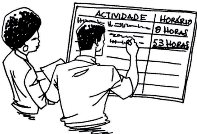
This entrepreneur and manager are monitoring the hours that individuals have worked.

Long hours do not equal higher productivity. In fact, the opposite can be the case. If you are spending 12 hours a day at work (not to mention travel time), it is likely that fatigue will make you inefficient, moody and prone to accidents. You are also very unlikely to have much time or energy for your family.