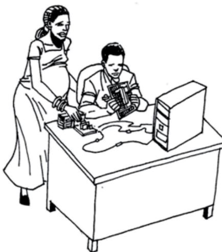
This pregnant worker is training a colleague to do her job in preparation for her maternity leave.