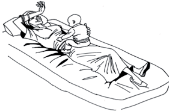
This new mother is taking a much needed rest, with her baby.

Giving birth makes enormous demands on the woman and sometimes it may involve risks or health complications for the mother and her newborn, such as: delivery by caesarean section, multiple births, premature birth and stillbirth. However, regular medical checks and attention can often help detect and prevent problems.