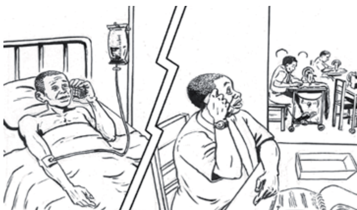
This office worker is reassured by being able to use a workplace telephone to keep in touch with a sick relative.