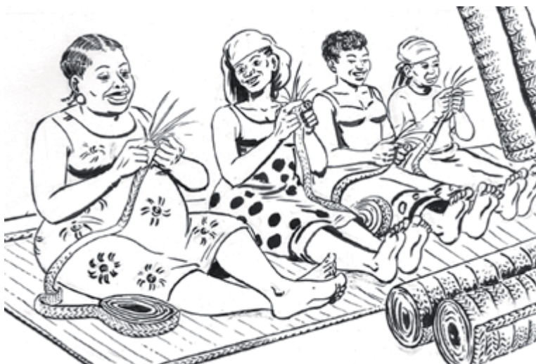
This pregnant worker is able to carry on working without any problems.