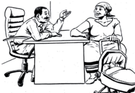
This manager and worker are planning for the worker's return to work.

Knowing that leave comes with the right to return will reassure workers and improve their loyalty and their feeling of being valued by the business.