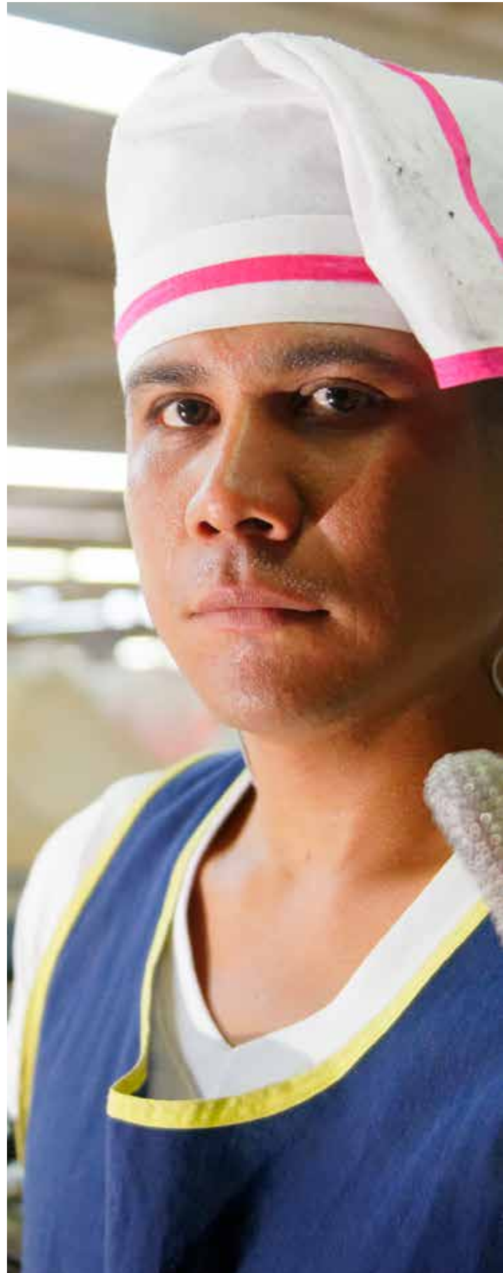
A garment worker shows his metal mesh gloves for cut protection on the factory floor of a clothing plant (Nicaragua). The ILO-IFC Better Work Programme aims to improve both compliance with labour standards, including work conditions, and competitiveness in global supply chains.

At the same time, the exercise of the rights to freedom of association and collective bargaining has proved vital to building effective, consensus-based responses to the crisis. In a growing number of instances, employers and workers are negotiating measures to mitigate or limit the consequences of the crisis on health, jobs and incomes, and to support recovery. 14 Negotiated agreements between employers' and workers' organizations have been critical in many settings to protecting workers' health and limiting the spread of the virus in workplaces. In Colombia, for example, the employers' organization of banana producers (Augura) and the agricultural workers' union (Sintrainagro) negotiated and signed a Bio Security Protocol . 15 Covering 22,000 workers, the agreement includes occupational safety and health protocols for personal protective equipment, physical distancing, handwashing, and cleaning and disinfection of work premises and equipment. Joint union-employers health and safety committees monitor implementation.