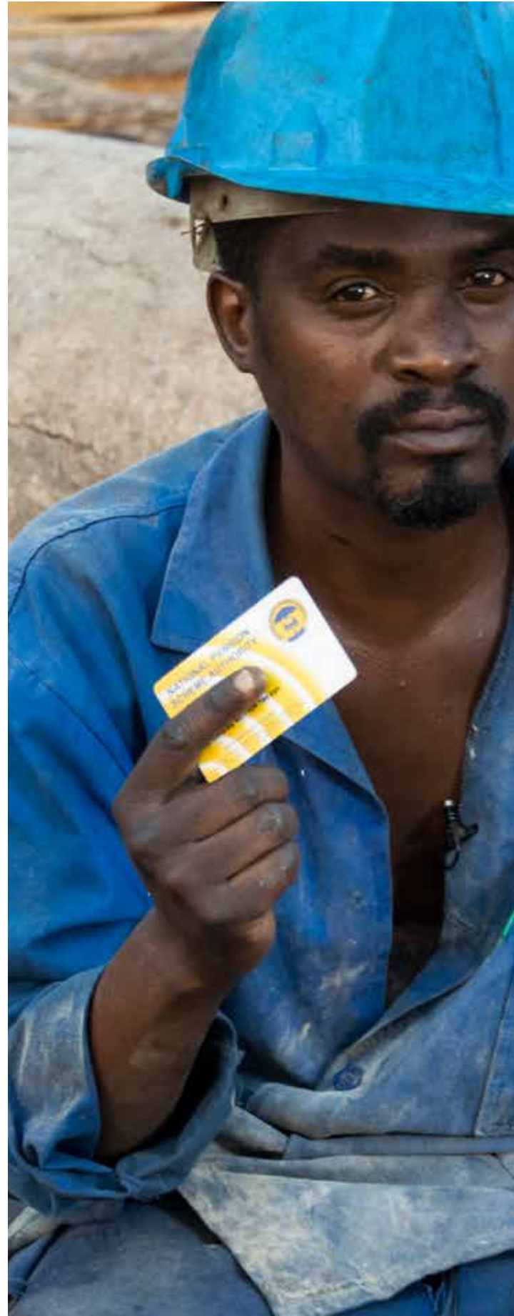
Construction sector worker showing his membership card to the National Pension Scheme Authority (Zambia). Only 27 per cent of the world's population has adequate social security coverage and more than half lack any coverage at all. The ILO actively promotes policies and provides assistance to countries to help extend adequate levels of social protection to all.

Mitigating human rights risks in the labour market. The pandemic is likely to increase the risk of human rights violations in the labour market, as businesses at all levels struggle to cope with the crisis and the severe demand shocks associated with it. This heightened risk underscores the continuing importance of companies undertaking human rights due diligence throughout their supply chains. Effective due diligence means assessing actual and potential risks of human rights violations within the supply chain, and integrating and acting promptly upon the findings. Identifying and prioritizing “hotspots”