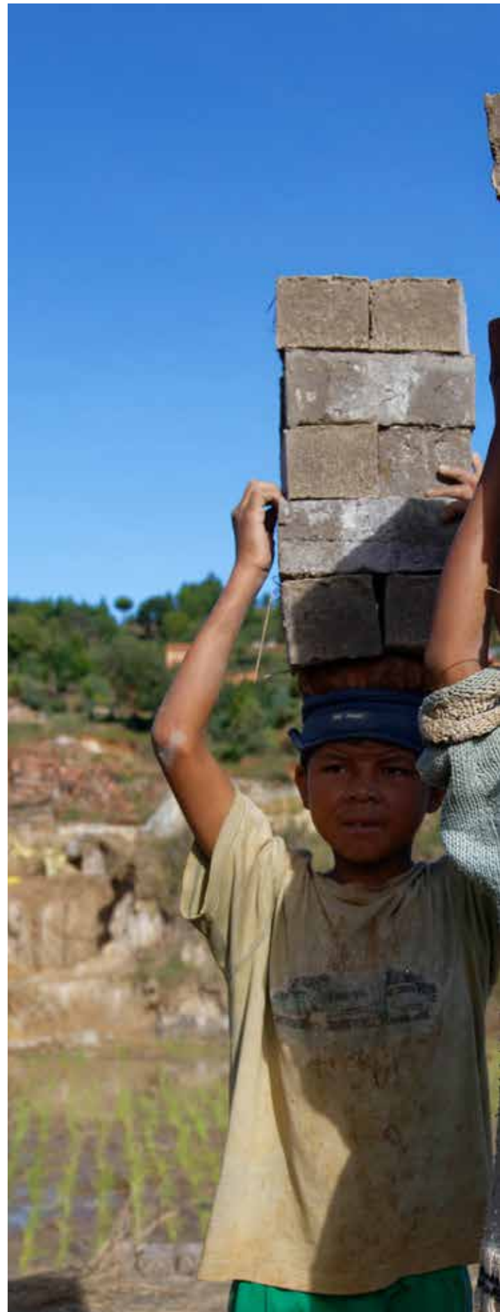
Young boys carrying bricks on their head in Antsirabe (Madagascar). They work at a brickyard that employs children. The ILO is supporting Madagascar's efforts to tackle child labour.

School closures as a result of COVID-19 lockdowns are adding to the risk of child labour. At their peak, temporary school closures affected more than 1.5 billion children and youth worldwide. 62 An interruption of education on this scale is unparalleled, and the implications for child labour, and the rights of children more broadly, could be profound. There is ample evidence that when children are out of school and enter paid employment, it is difficult to persuade them to return to school. 63