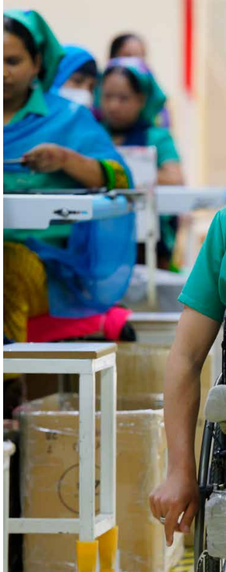
A garment worker with disabilities smiles during his shift in a clothing plant (Jordan). The ILO-IFC Better Work Programme assist companies to accommodate disabled employees in accordance with the type and extent of their disabilities, including adjusting workplace access, tools and/or personal protective equipment if necessary.

Again, these patterns have parallels in past crises. The 2008–09 financial and economic crisis showed that when jobs were scarce, women encountered greater difficulty in accessing them, partly as a result of traditional gender stereotypes around men’s role as principal breadwinners and women as caregivers within the home. 95 Increased competition for casual and domestic work placed downward pressure on women’s wages as many women had little choice but to enter into informal employment following economic contraction. 96 Evidence from the 1997–98 Asian financial and economic crisis also underscores the disproportionate effects of crises on women workers. 97