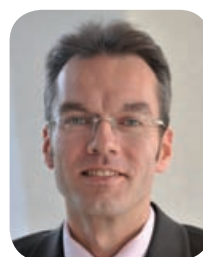
Ekkehard Ernst Chief, Employment Trends Unit

International Labour Office (ILO). 2012. Global Employment Trends 2012: Preventing a deeper jobs crisis (Geneva).