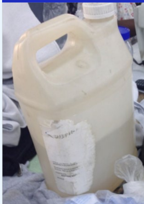
► Figure 2. Torn label on chemical container

While compliance with SDS requirements was relatively more likely than with labelling requirements, deficiencies were still noted in approximately half of the factories. The root of many SDS problems stemmed from factories not receiving SDS from original chemical manufacturers but rather downloading forms from various websites, contrary to the requirements of Vietnamese law.