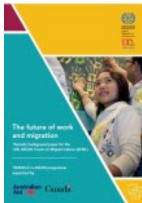
The future of work and migration: Thematic background paper for the 12th ASEAN Forum on Migrant Labour