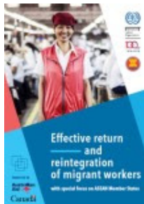
Effective return and reintegration of migrant workers with special focus on ASEAN Member States