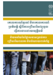
ILO's General principles and operational guidelines for fair recruitment and definition of recruitment fees and related costs in Khmer, Lao, Myanmar, Thai and Vietnamese