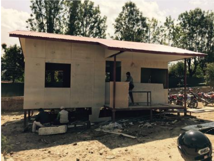
Photo 1: Migrant Resource Centre under Construction in the Labour Village, Kathmandu