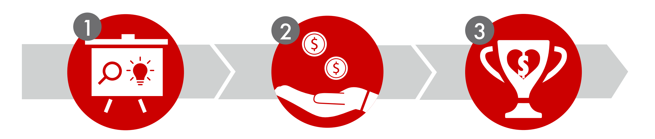
STEP 1 Understanding your unique situation